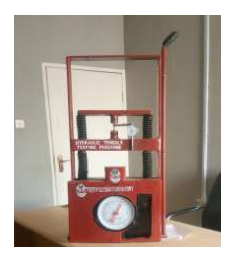
Plate 2: Pictorial view of the prototype tensile testing machine